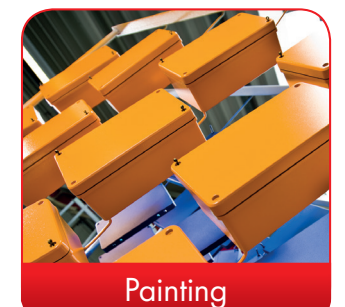
We can also paint all our enclosures in any RAL colour you desire. The application of primer and special colour