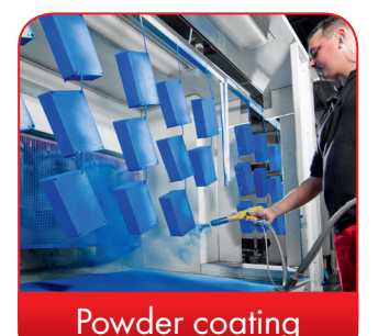
We can powder coat enclosures, command enclosures and suspension systems in any RAL colour you desire. Custom colours are of course also possible.