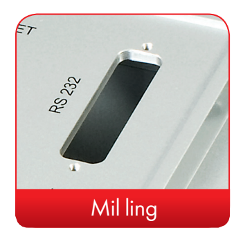
Thanks to our modern CNC production, we can quickly and efficiently mill custom-fit cut-outs and contours to match your exact specifications.