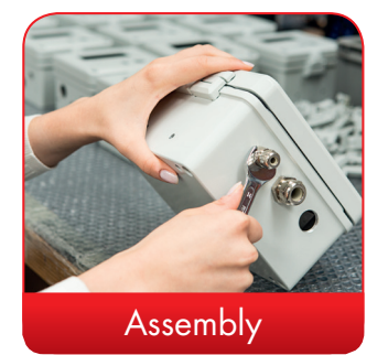
Would you like to have all your components supplied already assembled? No problem. Our assembly team will be pleased to perform all assembly work on your behalf.