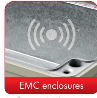
We offer our conFORM low-price standard EMC enclosure to protect your internal mounting against electromagnetic radiation. On request, we can also supply an EMC-compliant version of any other ROLEC enclosure.

If you have any requirements for services not listed here, please ask us. Customer-specific solutions are our speciality. We also are keen to take on unusual tasks.