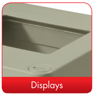
We are able to offer the right made-tomeasure display for all our enclosures - in varying sizes and degrees of robustness depending on the application.