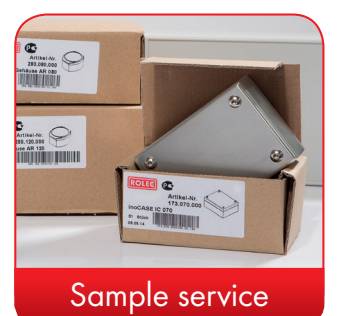
Test our products with your internal mounting. We'll be pleased to send you a sample enclosure for inspection with no strings attached.

Everything begins with individual advice. We'll be pleased to support you with your project and find solutions for every requirement. Customer-specific solutions are our speciality.