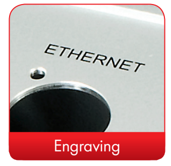
Our services also include engraving your logo and other elements, which we can of course perform in any colour you desire.