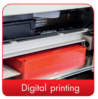
Digital printing is particularly worthwhile for low-volume order s and for realising complex pa tterns or images.