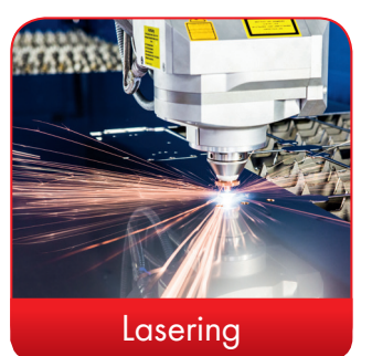
We can process stainless steel enclosures and plates quickly and reliably according to your individual requirements thanks to our in-house lasering centre.