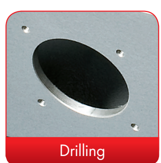
We'll manufacture every enclosure for you according to your exact specifications - whether they involve precise drilling or large tolerance.