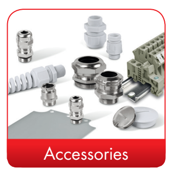
ROLEC's portfolio also includes matching front plates, mounting plate, supporting rails and terminal blocks as well as a range of cable glands, blanking plugs etc.